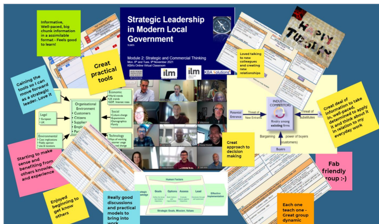
Image of the online Tools - now used for In-Person breakouts

FEEDBACK RATING 3.8/4.0 of 4000+ reviews Excellent