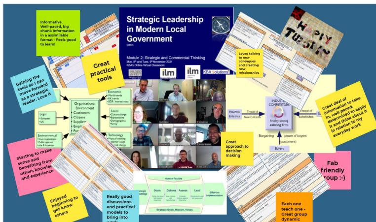
Image of the online Tools - now used for In-Person breakouts

Feedback Ratings 3.8/4.0 of 4000+ reviews Excellent